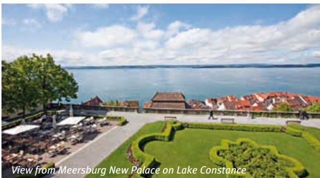
View from Meersburg New Palace on Lake Constance