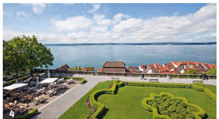
1 Ittingen Charterhouse 2 Wartegg Castle 3 BBZ Arenenberg 4 Meersburg New Palace

info@art-cities-reisen.de | www.art-cities-reisen.de